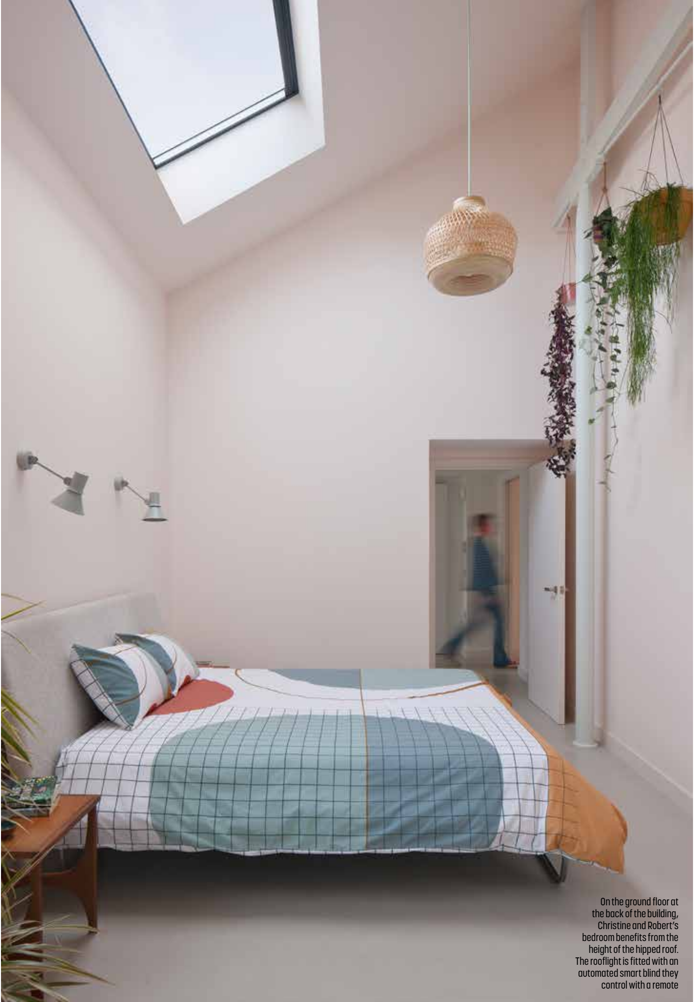
On the ground floor at the back of the building, Christine and Robert's bedroom benefits from the height of the hipped roof. The rooflight is fitted with an automated smart blind they control with a remote