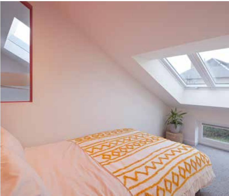
RIGHT A guest bedroom on the first floor has an internal window with toughened glass overlooking the living area below. When he’s old enough, this will be Corran’s room