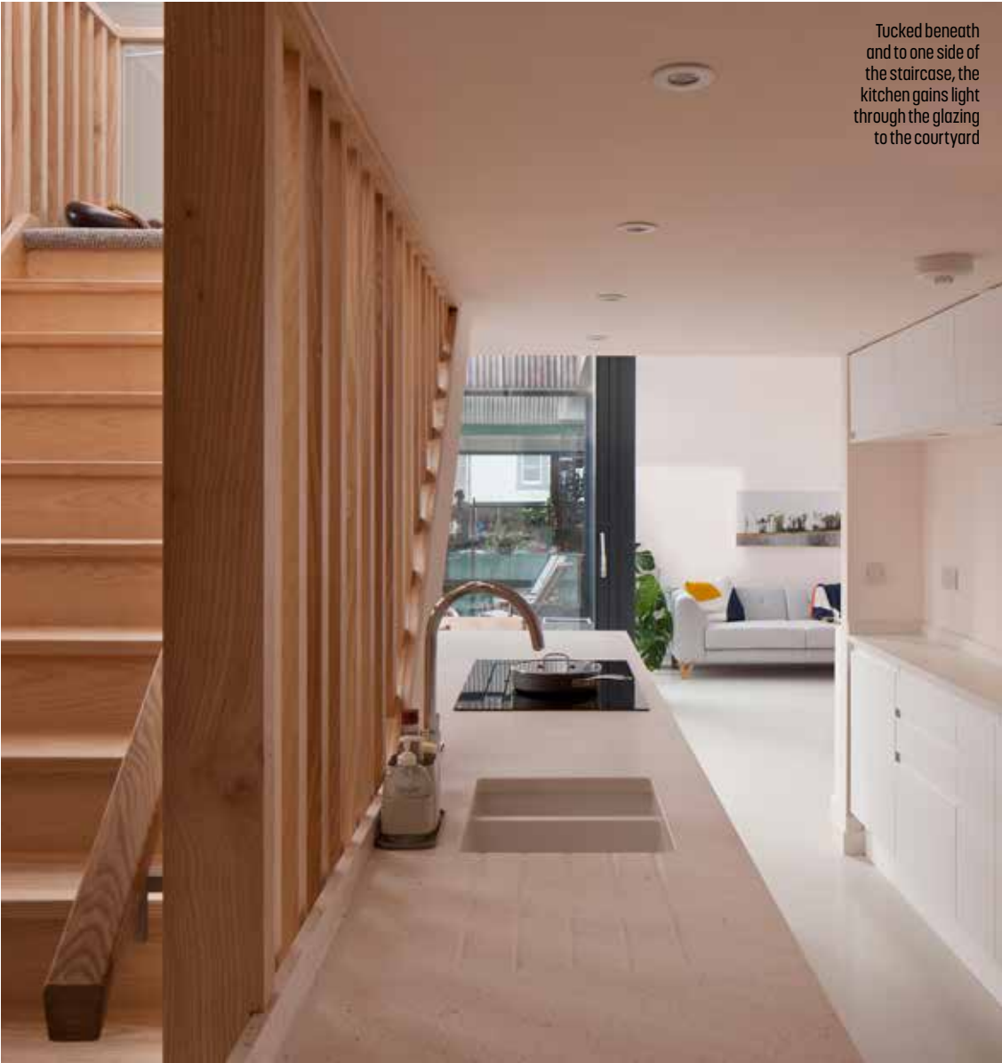
Tucked beneath and to one side of the staircase, the kitchen gains light through the glazing to the courtyard

Installing rooflights in the slate roof brightens the rooms below and a new dormer at the rear of the building, clad with zinc panels and scorched larch, provides headroom in the family bathroom. 'Throughout the house, there is polyisocyanurate (PIR) insulation on/in? the external walls, at a depth of between 100-150mm, and beneath the concrete floors and in the ceiling,' says Thea. 'It limits heat loss, enabling the main living space to be open plan.' All the partition walls have a glass mineral wool roll filling. Despite it costing more than a fossil-fuel powered heating and hot water system, Christine chose to fit renewable energy generation for its sustainability. So, most of the family's energy needs are met by an »