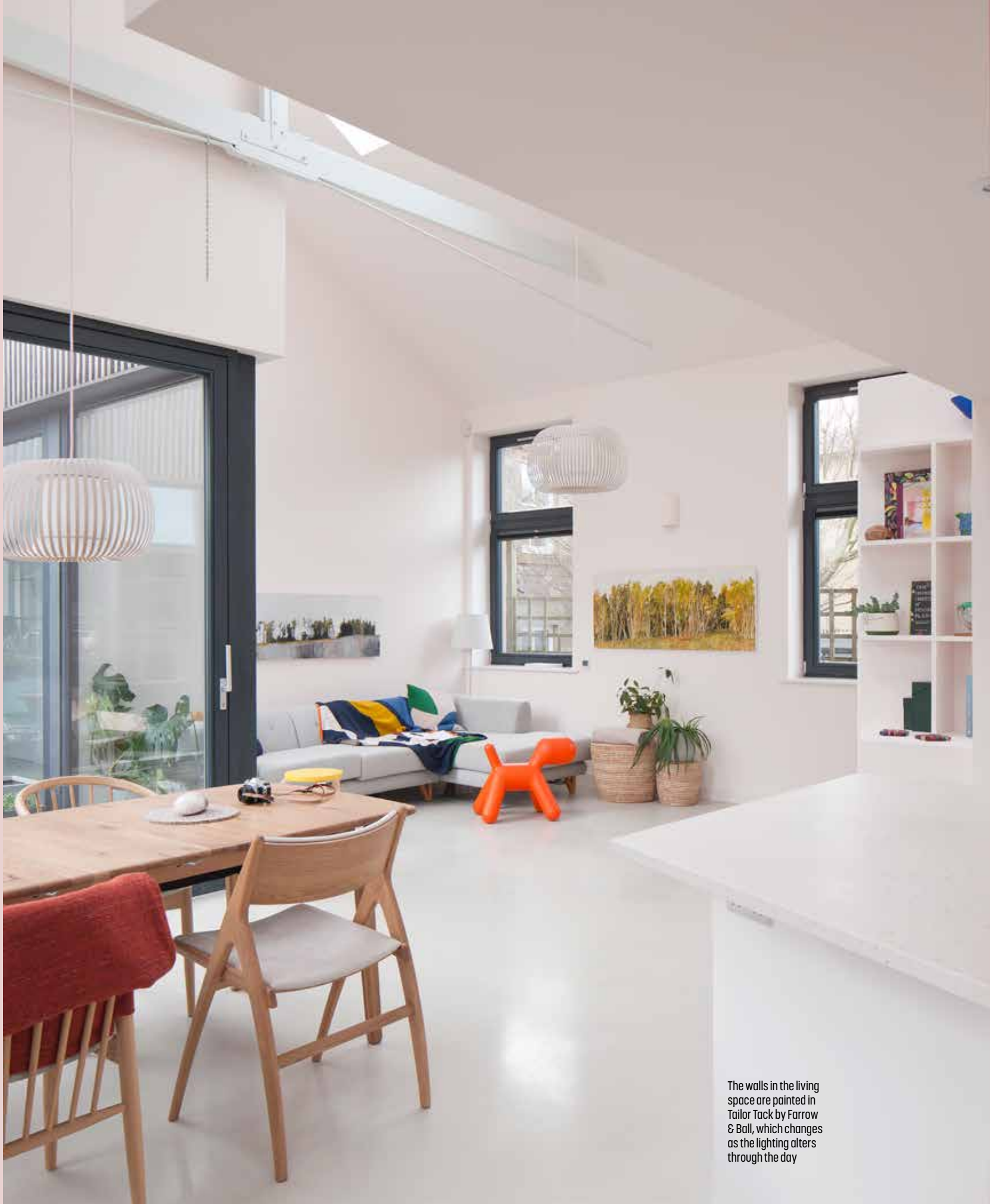
The walls in the living space are painted in Tailor Tack by Farrow & Ball, which changes as the lighting alters through the day

Investigating various possible configurations involved creating several different 3D models. The architects' final design, which met with the approval of the local planning authority, includes a new first floor, boosting the total area to 157sqm. Christine and Robert's en-suite bedroom is on the ground floor, as is the open-plan kitchen, dining and living areas and a cloakroom. Upstairs there are two bedrooms, the family bathroom and a roof terrace, which shelters the front door. After taking down the suspended ceiling, the construction of the new floor began with the installation of a steel frame, timber joists and wooden floorboards – followed by the timber frame and plasterboard walls.